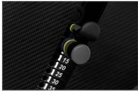
2.5kg Incremental weight stack