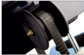
Universal belt driven design