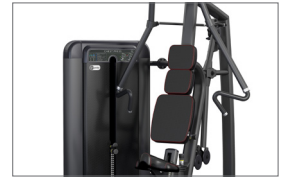
Low profile weight stack