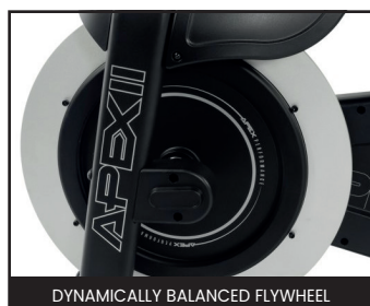
DYNAMICALLY BALANCED FLYWHEEL