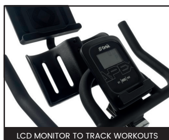
LCD MONITOR TO TRACK WORKOUTS