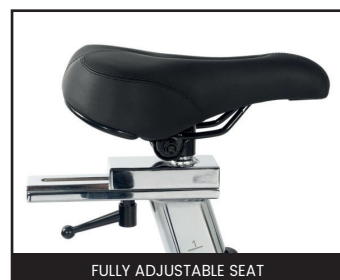
FULLY ADJUSTABLE SEAT

Battery powered, Easy to Read display, Showing Km/hr on the top line, cycle through other readouts. Connect to wireless chest strap to monitor heart rate. SOLD SEPARATELY*