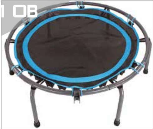
Repeat step 7-10A and finish attaching cords at position 3 on all six frame rails.