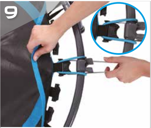
Make the tool go through the cord and lock one end of tool on the back of the holder.