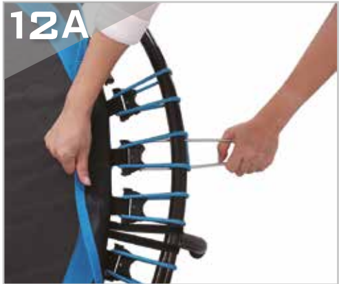
Repeat step 7-10A to assemble the cords at 2nd and 4th positions of holders on each section of frame rail. Step 12A is the 2nd position.