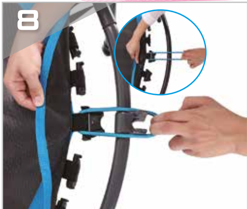
Enclose the cord onto the holder, and make it goes around the frame rail. The cord must be fixed within the 2 raised parts of the holder.