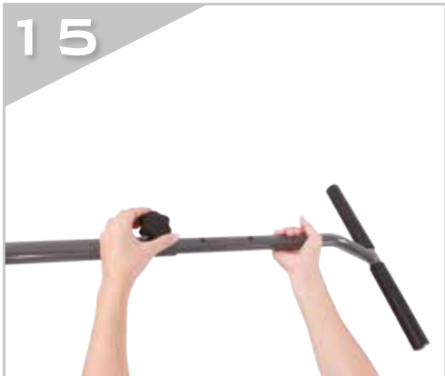
Tighten the handlebar and the upper handrail with the adjustment knob.