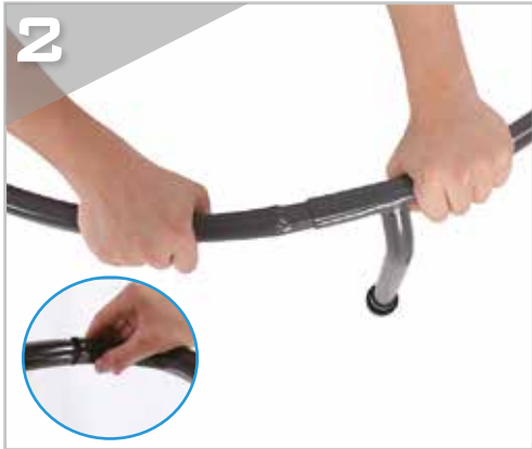
Hold 1 section of frame rail with one hand and insert another section as picture shown. Push ball pin when inserting the rails.