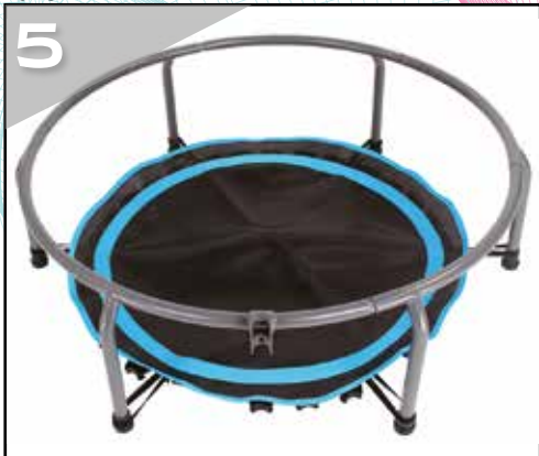
Put each band onto each leg tube.