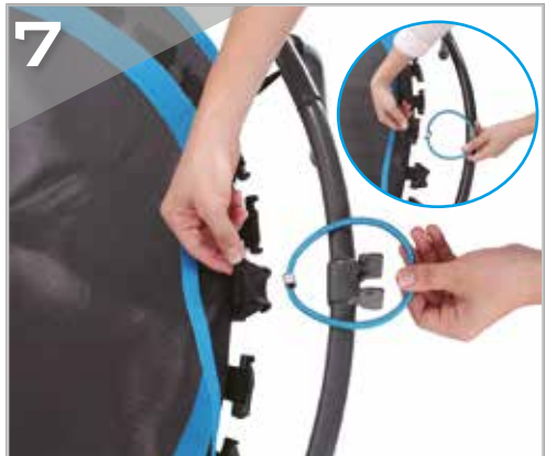
Find the middle (3rd) position on frame rail, and start with the 1st bungee cord. One section of rail has handrail bracket.