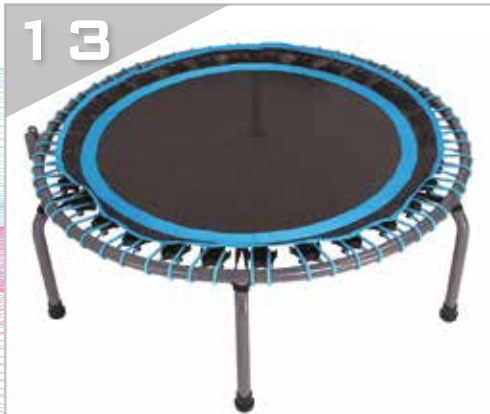
Bungee cord assembly is completed.