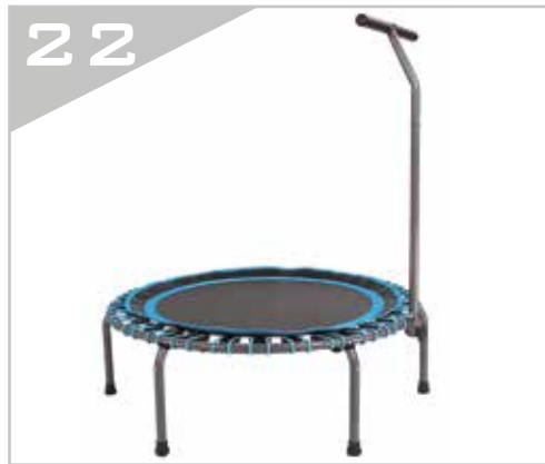
Assembly of trampoline is completd.