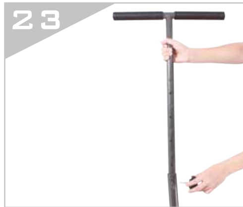
There are 4 positions of handrail for height adjustment. Loosing the adjustment knob and re-tighten it back to a suitable position.