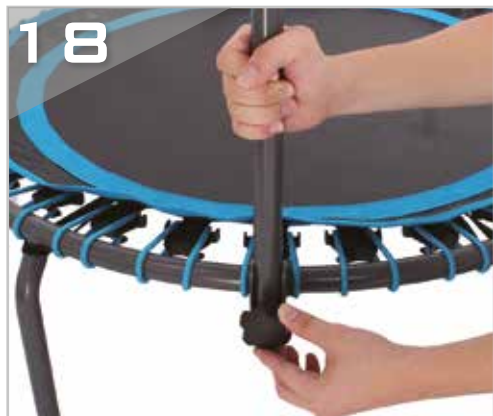
Tighten the handrail (along with the knob) onto the handrail bracket.