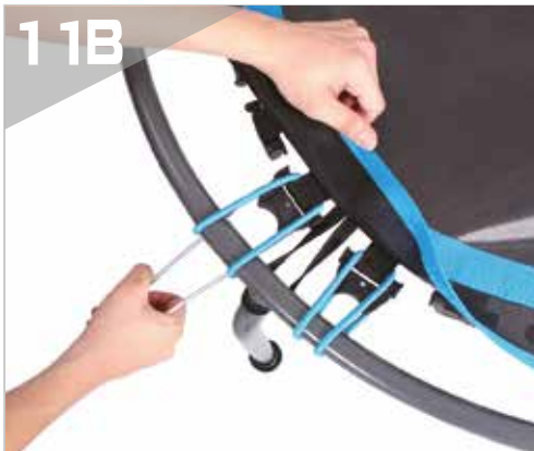
Step 11B is the 5th position.