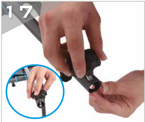
Insert the knob onto bottom of handrail tube.