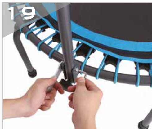
Fix the handrail with the bolt (M8X50), inner washer (M8), and hex nuts (M8) by using Allen wrench and L shape wrench.