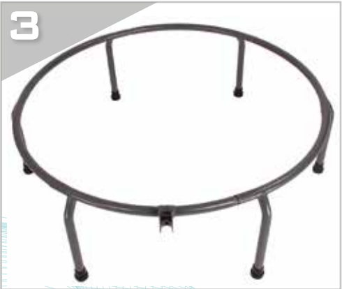
Follow the previous step to complete the connection of all the frame rails.