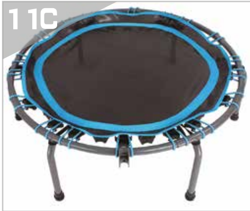
1st and 5th positions of bungee cords assembly is completed.