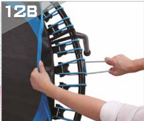
Step 12B is the 4th position.