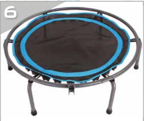
Pull up the jumping mat to highest position. Now we are ready for the steps of assembling bungee cords.