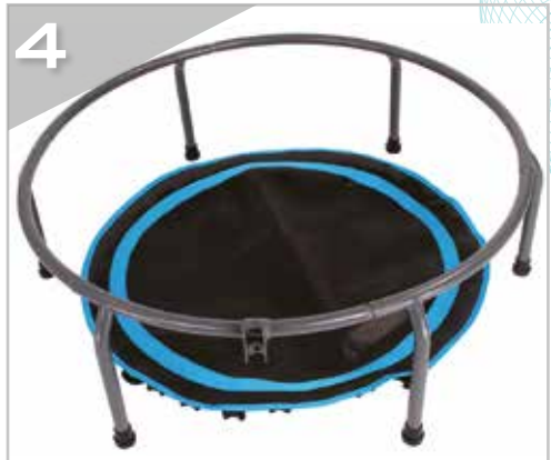
Put the jumping mat in the center.