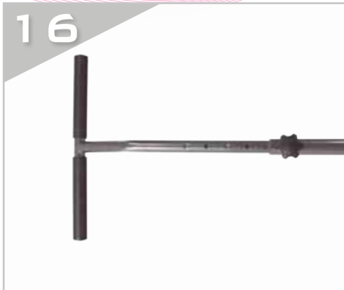
Assembly of handrail is completed.