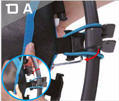
Push down and rotate the tool inward to make the cord reach the holder. Pull out the tool by simply twisting it to the right side and pull it out.