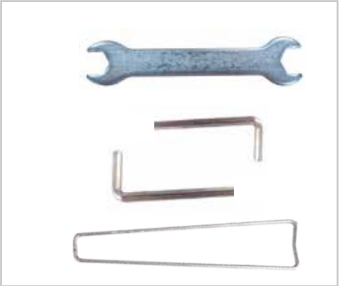
Tool bag: assembling tool