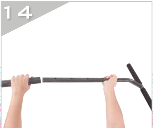
Insert the handlebar into the upper handrail tube.