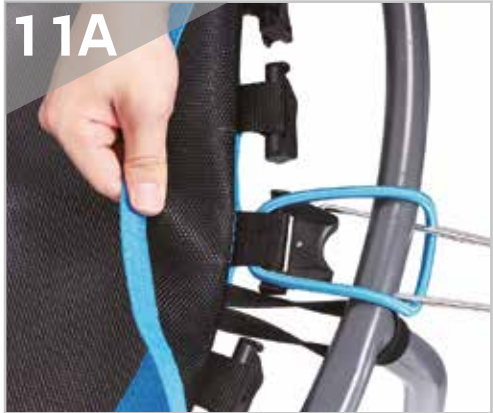
Next, repeat step 7-10A to assemble the cords at 1st and 5th positions of holders on each section of frame rail. Step 11A is the 1st position.