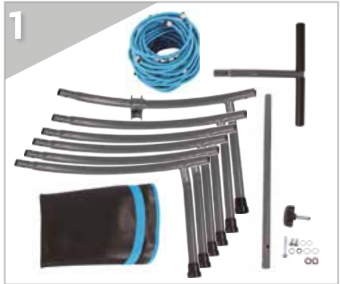
Check if all the parts are included.