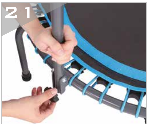
To fold the handrail, loosen the knob.