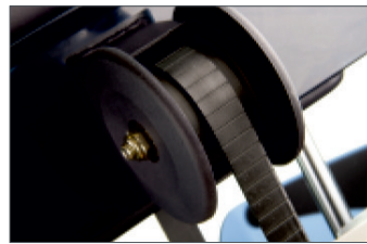
Universal belt driven design