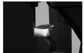
Aluminium touch points