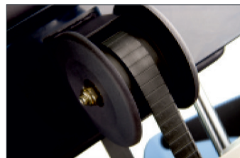
Universal belt driven design